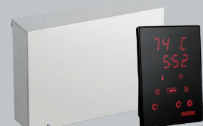
Xenio CX30/CX45 control unit